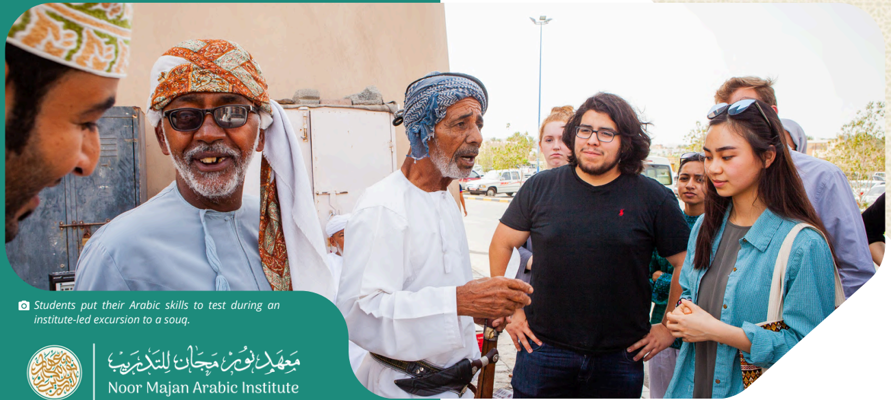
Students put their Arabic skills to test during an institute-led excursion to a souq.