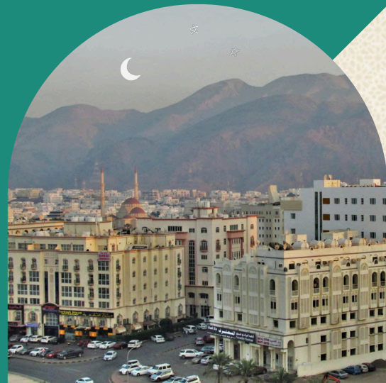
AL KHUWAYR, MUSCAT

Noor Majan Arabic Institute is located in the Al Khuwayr neighborhood, with close access to restaurants and some of the city's largest shopping centers.